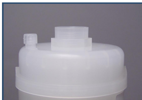
1/2" Female NPT