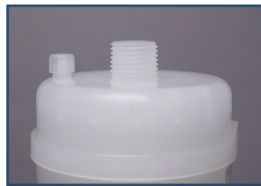
1/2" Male NPT