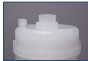
3/8" Female NPT