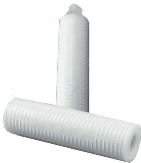
Figure 1: Flotrex PN Filters