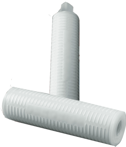
Figure 1 : Memtrex MP-E (MMP-E) Filters