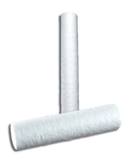
Figure 1 : Purtrex Depth Cartridge Filters